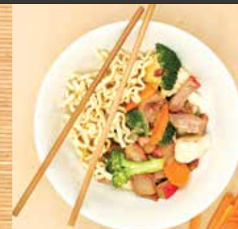
BBQ Pork Chow Mein