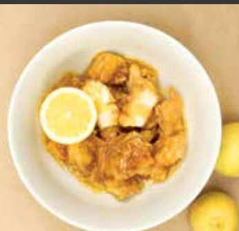
Lemon Sauce - Chicken