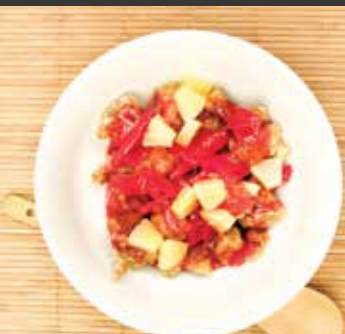
Sweet & Sour Pork