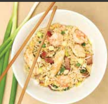
Bamboo Special Fried Rice