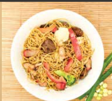
Combination Hong Kong Style Chow Mein